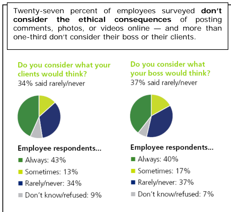
Pie chart 2